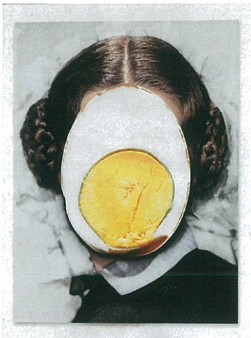
Urs Fischer's Historic Problem , 2013